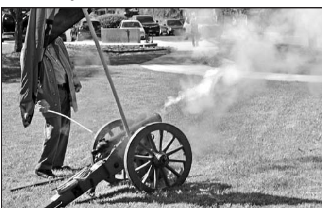
A cannon salute to the Confederate dead in Union County War Memorial Park on Saturday, April 28.